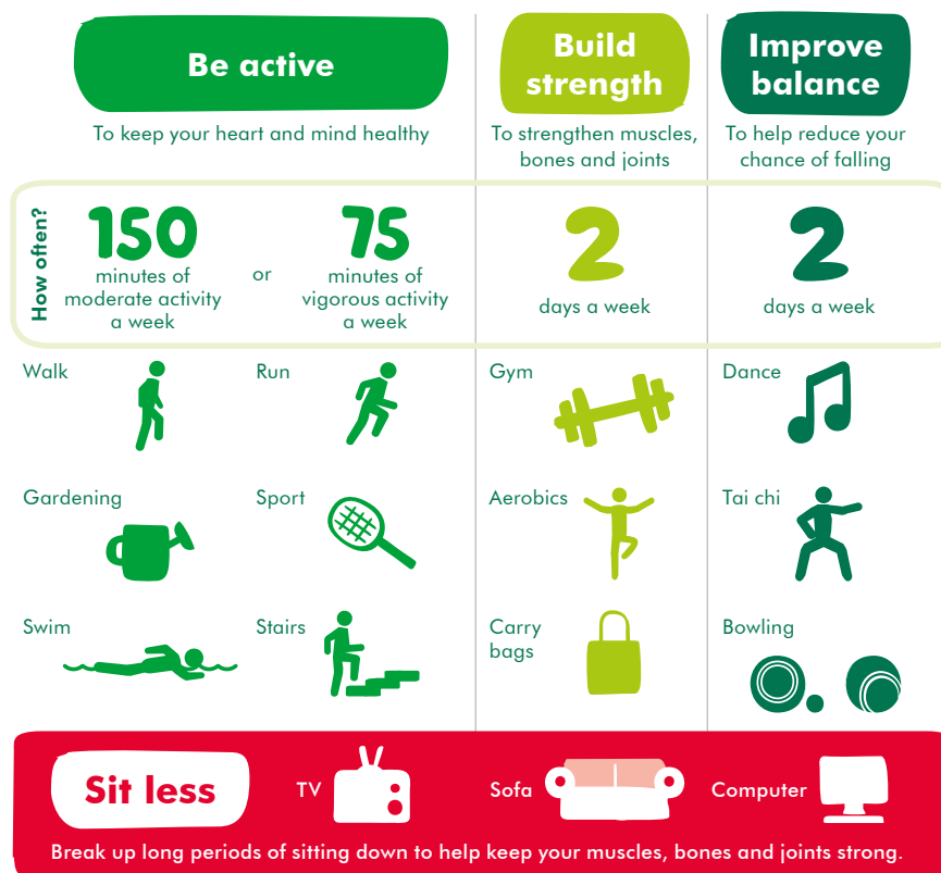
Figure 4. Older adult physical activity guidelines